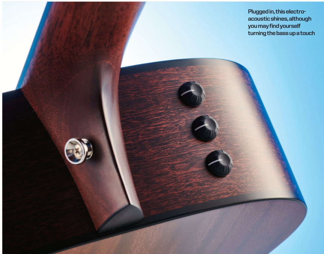
Plugged in, this electro-acoustic shines, although you may find yourself turning the bass up a touch

An acoustic recorded sound post-EQ and compression is often quite different to what you hear from it in the room, being tracked. This guitar feels EQ'd in that way already. The pre-fitted medium phosphor bronze Elixirs already